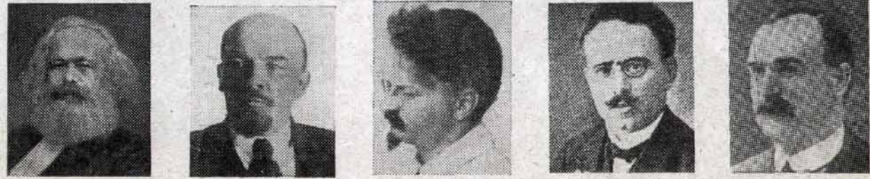
MARX LENIN TROTSKY LIEBKNECHT CONNOLLY

They served the Workers and scorned the Boss